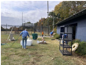
Sponsoring Event for Rotary Club of Farragut

KNOXVILLE CHALLENGER benefiting McNabb Center