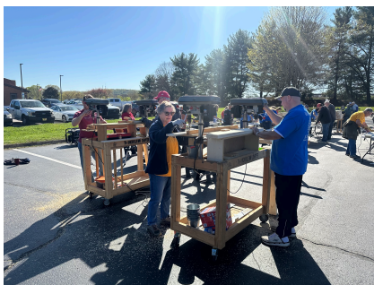
More hard work underway