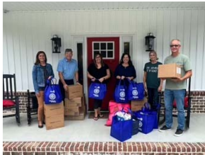
Delivery of toiletries to Isaiah 1:17 House. Items were donated by our club and Operation Compassion.