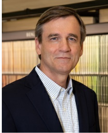
110th Rotary President