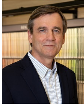
110th Rotary President

Rotary Meeting Thursday January 18, 2024 12 Noon Chattanooga Convention Center Ballrooms: H I J