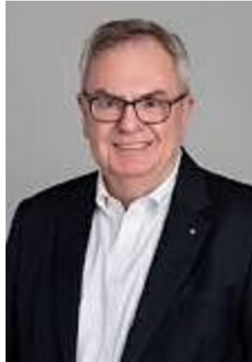
Rotary International President 2023-24 January Newsletter

In difficult times like these, it's impossible to avoid feeling heartbroken over the devastation and loss of life caused by war and destruction. Rotary always stands against harming and displacing civilian populations and using armed aggression instead of pursuing peaceful solutions. We advocate for the observance and respect of international law. We believe in strong action to defend and promote peace, even in the darkest of times.