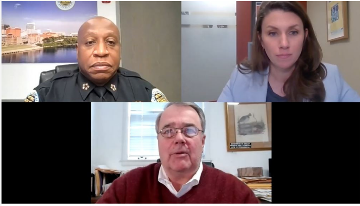
Nashville Rotary virtual meeting-January 4, 2021