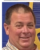
Heath Hill—Park Update