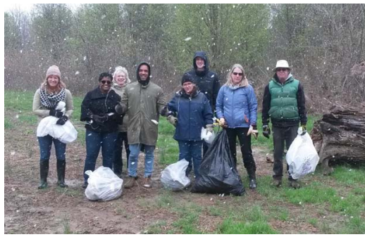
Volunteers from previous clean up days at Garvin Brown Preserve. We love our volunteers!

River Fields is hosting two opportunities in April for volunteers to help keep our local environment clean as part of this year's Mayor's Give A Day month of service . We'd love to invite you and your friends or family to get outdoors and help us keep our preserved land looking it's best for spring.