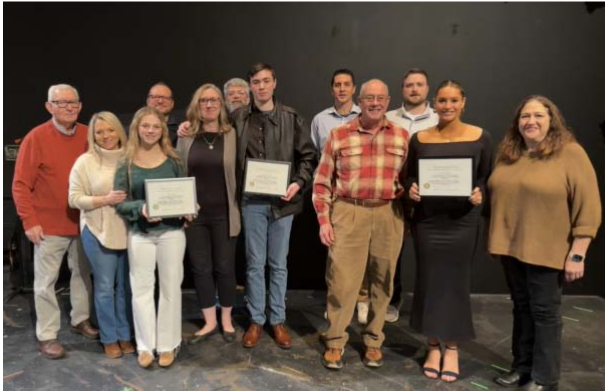
The South Oldham Rotary Club recognized their John Longstreet Students of the Month for January at their January 17th meeting.