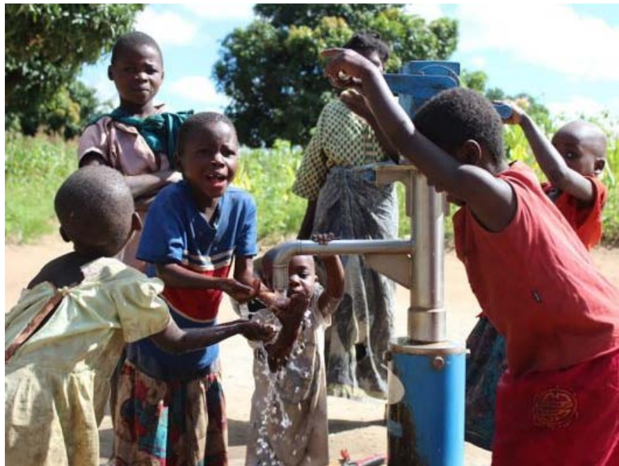
Children in a village in Malawi enjoy fresh drinking water thanks to a Global Grant supported by 26 clubs in our district.

For all of these reasons, I am asking you to take action and support The Rotary Foundation by joining the 125 Club for this year.