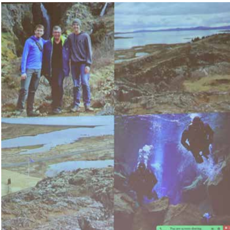
SARGE – “Two Truths and a Lie” featuring

The site is also significant for geological reasons, as it located along the fault line that separates the North American and Eurasian tectonic plates. There is an area there called Silfra, where my brother and dad snorkeled and I scuba dived using dry suits. It was so cold it was snowing out.