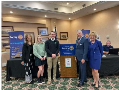
Elyria Catholic visitors