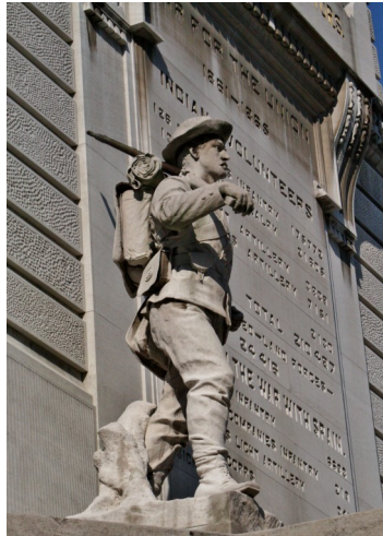
Spanish-American War soldier on the beautiful Soldiers & Sailors Monument (above), USS Indianapolis Memorial (below left), Veterans' Memorial Plaza (below right)