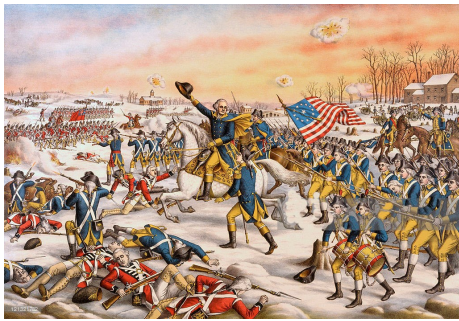
George Washington leads his troops in battle at Princeton, NJ

246 years ago, General George Washington and units of his Continental Army began 1777 on an auspicious note. Following on the Continental's December 26, 1776 victory at the Battle of Trenton, for which George Washington and his army "Crossed the Delaware", the Americans