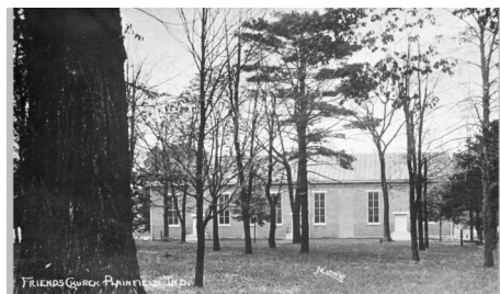
Original Western Yearly Meetinghouse

pews were saved as well. Two additions have since been made to the meetinghouse, one in 1950, and another in 2000. One of the oldest commercial buildings in Plainfield was built in 1874 as the Hamlet House, named after the owner. At one time it housed a location of the Keeley Institute, which promoted treatments for alcoholism. This building stands at the SW corner of