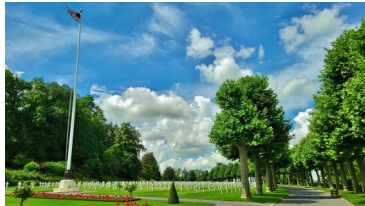
Aisne-Marne American Cemetery, Belleau, France - resting place of 2,289 WW1 American heroes.