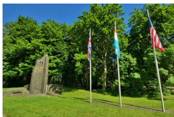
National Liberation Memorial outside Wiltz, Luxembourg remembers some of the bloodiest action to take place during the Battle of the Bulge.