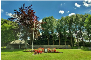
Malmédy Massacre Memorial, Malmédy, Belgium remembers the 85 American soldiers taken prisoner in the early days of the WW2's Battle of the Bulge, who were executed the same day as their capture by Nazi troops. (above & below)