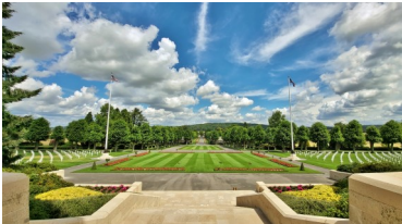
Aisne-Marne American Cemetery, Belleau, France - resting place of 2,289 WW1 American heroes.