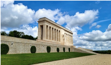
Chateau-Thierry WW1 American Monument, overlooks the French town of the same name. It commemorates U.S. troops' actions in this and the adjacent area of Belleau Wood.