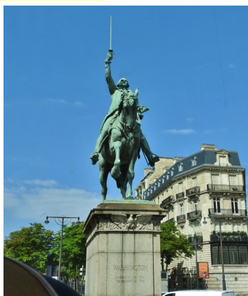
George Washington statue in Paris.