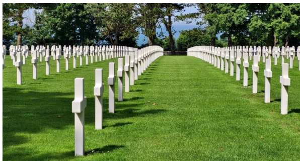
Normandy American Cemetery, resting place of 9,387 American heroes.