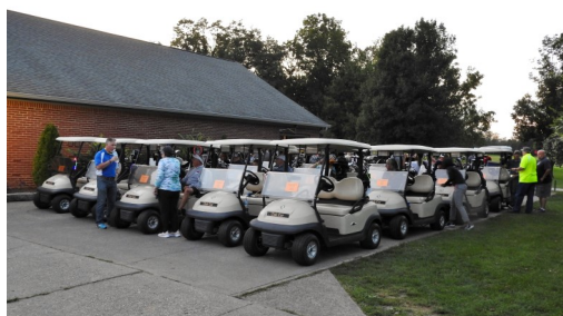
Carts on the starting grid, awaiting the command to start engines...