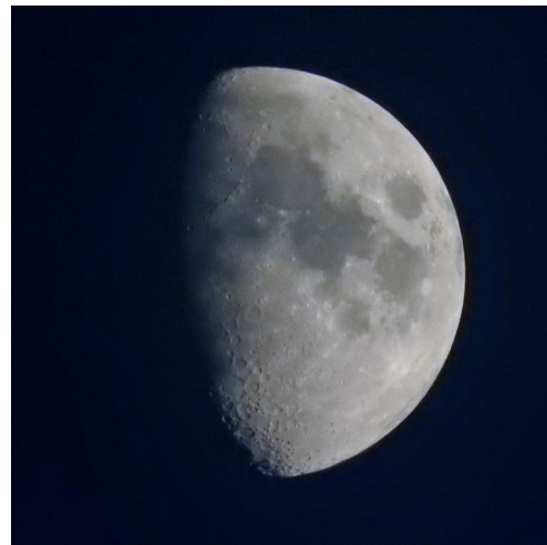
It was a beautiful moonlit night for golf!