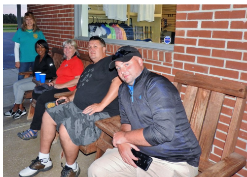
Team Geo Group—our Event Sponsor