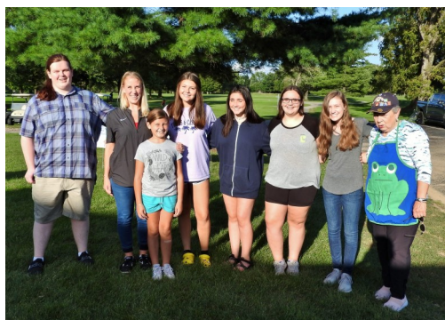
Interact Club members provided invaluable assistance