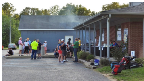
The crowd gathers...