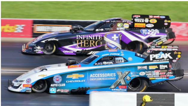
John Force drives past Jack Beckman to win the Funny Car class at the 65th U.S. Nationals.

We had no speaker last week, but your bulletin editor was still busy in Hendricks County. At the 65th Annual U.S. Nationals in Brownsburg, the world's biggest drag race, 70 year old John Force, whose operational headquarters is also in Brownsburg, won his 151st national event. Maybe we should form a Plainfield Rotary drag racing team—you only have to drive straight & fast for 7 seconds!