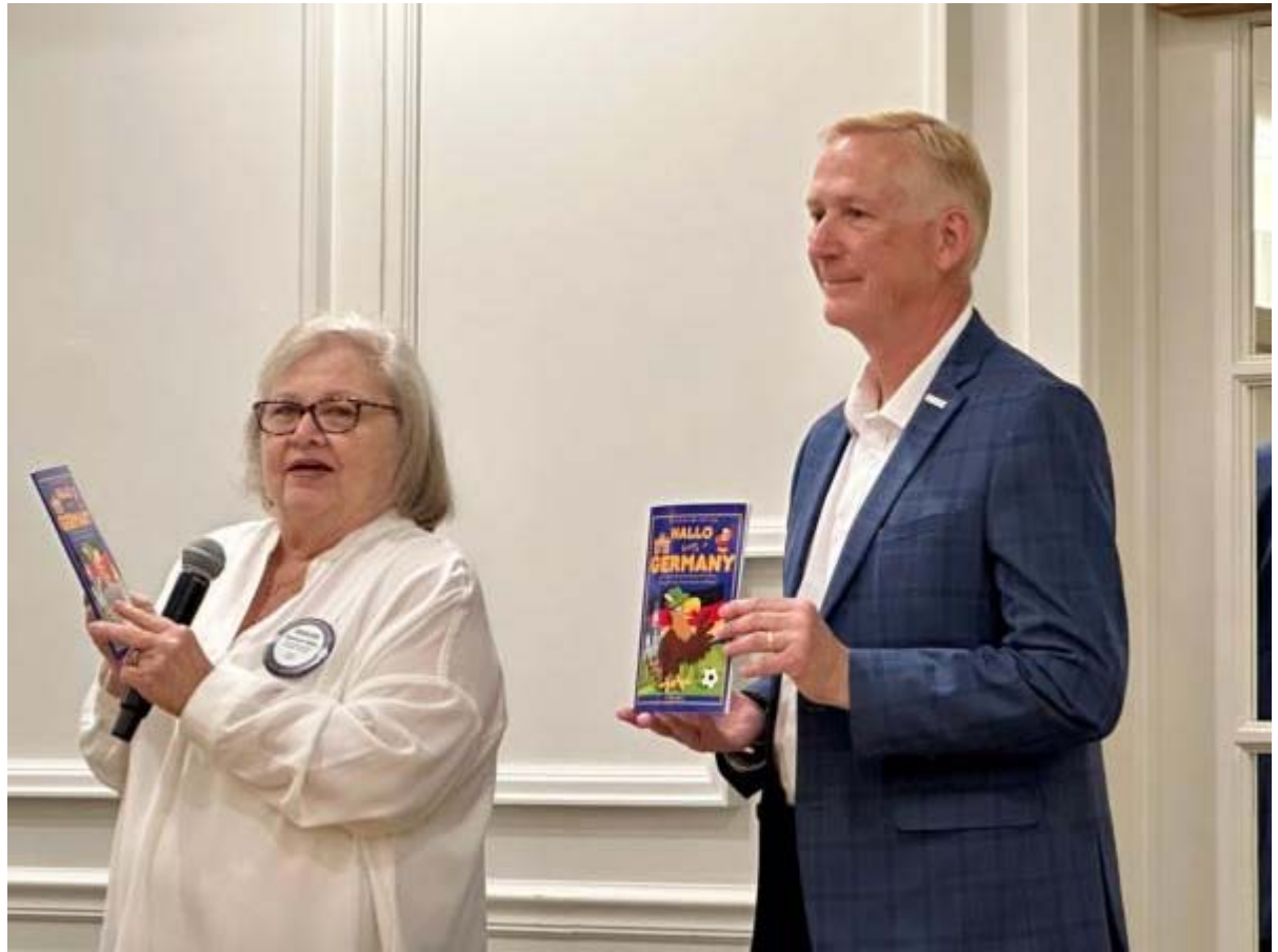
President & CEO The International Center and Honorary Consul of France to Indiana