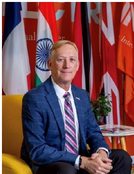
President & CEO The International Center and Honorary Consul of France to Indiana