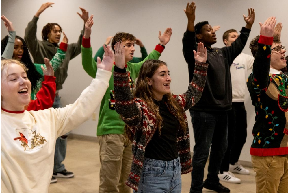
A very lively group at 7 AM!