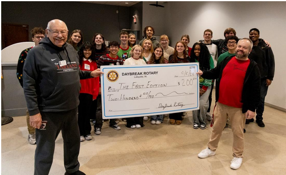
We also presented a check for $200 to support the Choir.

Thought of the Week: I've had a pretty good lesson in human nature. It's more important to try to surround yourself with people who can give you a little happiness, because you only pass through this life once, Jack. You don't come back for an encore. ~ Elvis Presley