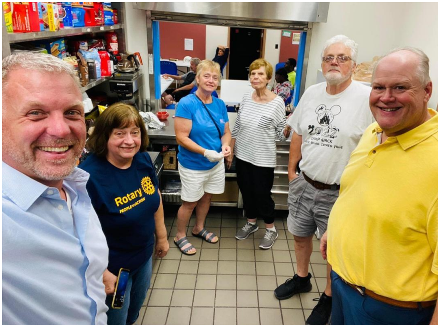
The LUM crew from this month!