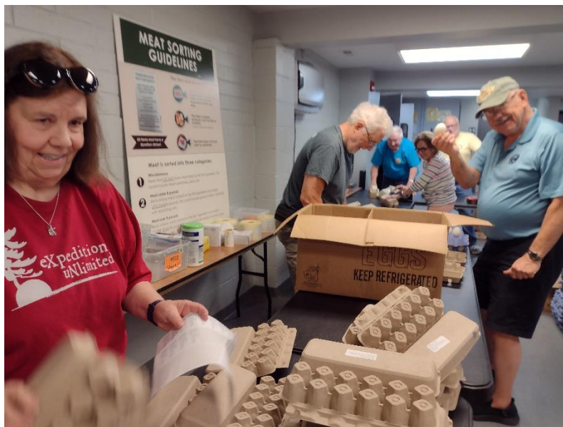
We learned that duck eggs are substantially bigger than chicken eggs – but it did work!