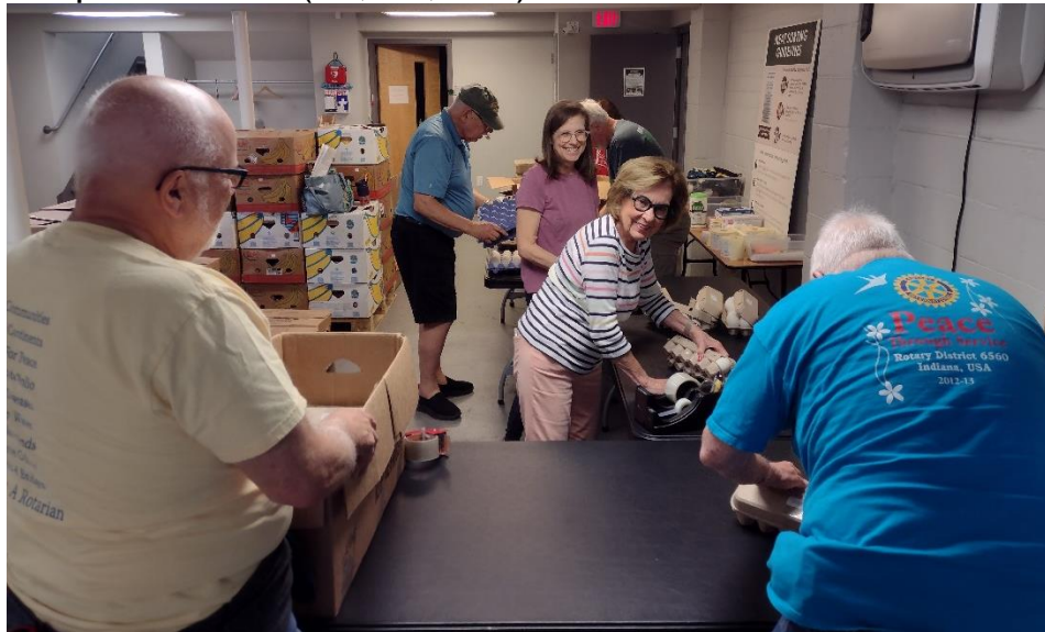
The Duck Egg Crew at work at Food Finders Food Bank

Crayola watercolor paint set x10. Painter's tape 1-inch rolls Painters tape 1/2 inch rolls Watercolor paper pads Multi-color packs Sharpies Thick chisel tipped dry erase markers Dry erase marker spray- 2 bottles. Non-acetone nail polish remover for sensitive skin x 3 bottles White cardstock Graphite Pencil (6h, 4b, etc.) sets x 5