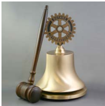
New Officer Installation