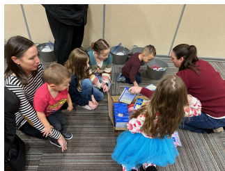
Kids at the Fishers Rotary Impact meeting assembled Birthday Buckets for the Food Pantry last meeting.