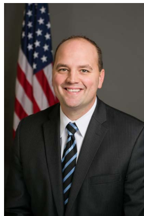
Mayor Scott Fadness

It's always a fascinating program when Fishers Mayor Scott Fadness stops by. Join us to hear the latest happenings in our city and learn about what's coming down the road.