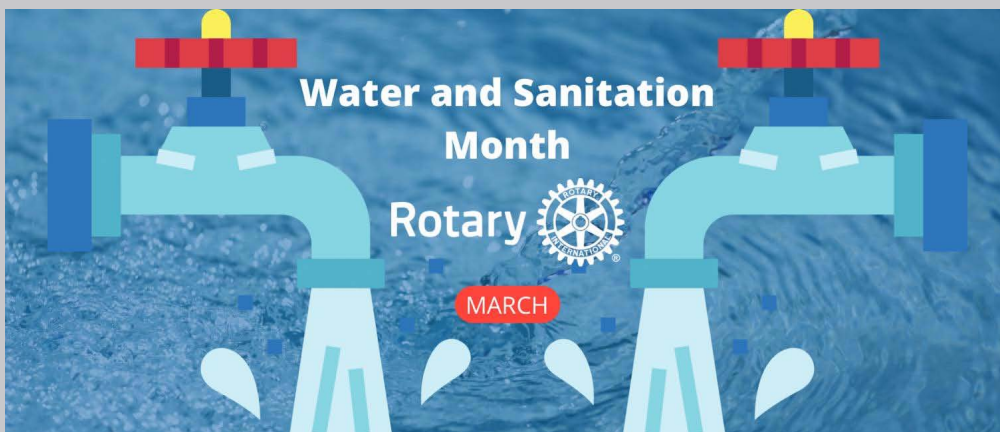
World Water Day focuses on water's importance

The COVID-19 pandemic has made it clearer than ever that hand washing -- which requires a safe water source -- is essential to our health. Yet more than 2 billion people worldwide don't have access to clean water. Since 2014, The Rotary Foundation has invested more than $51 million in global grants to enable clubs to carry out projects that help people around the world with clean water, sanitation, and hygiene. For World Water Day on 22 March, learn how you can get involved in a water project and give to support our work in this area through our Donate page . Go to the Areas of Focus tab and choose Water, Sanitation, and Hygiene .