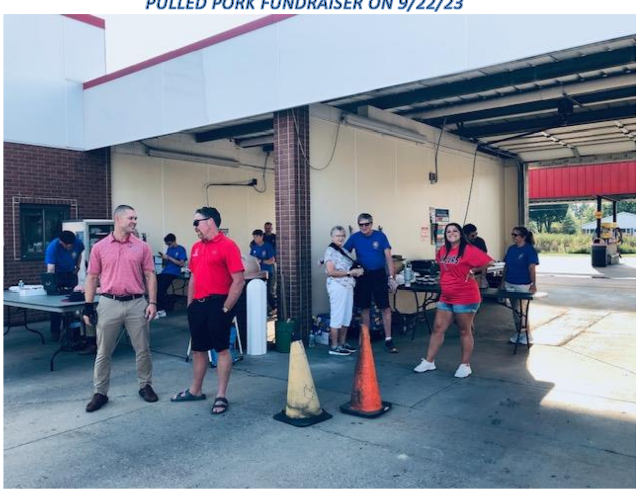
Page 8 of 10