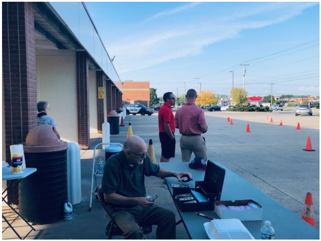
PULLED PORK FUNDRAISER ON 9/22/23