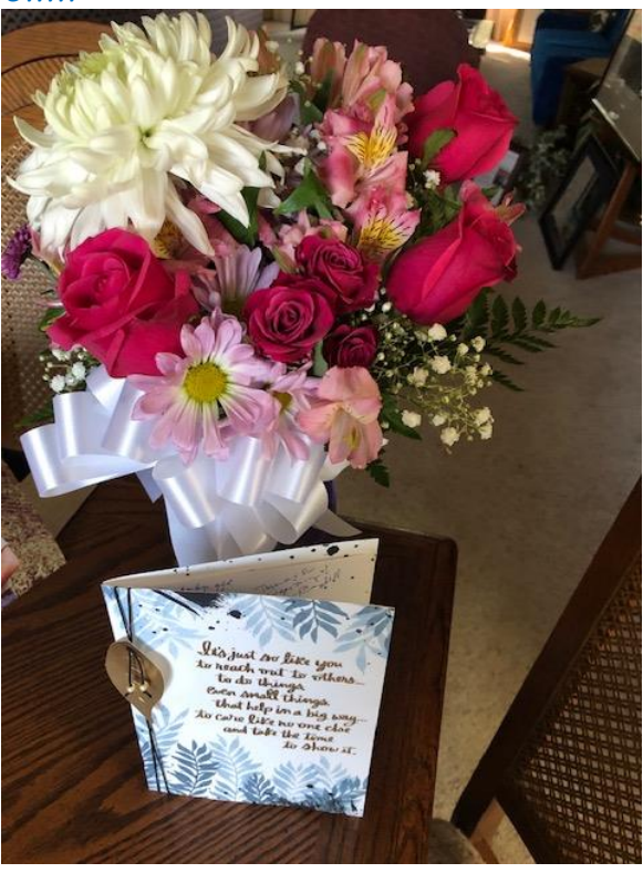
AND A BEAUTIFUL CARD FULL OF APPRECIATION!!!