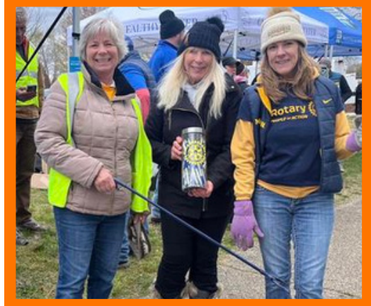
Kalamazoo River Clean Up Rotary Crew