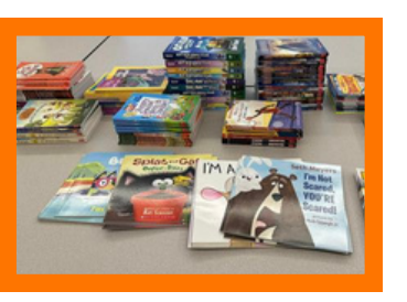
GLARC Book Donation to Richland Elementary School PTO