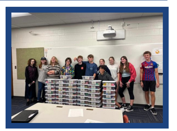
Gull Lake Middle School Interact Club filling 50 fidget boxes for teachers