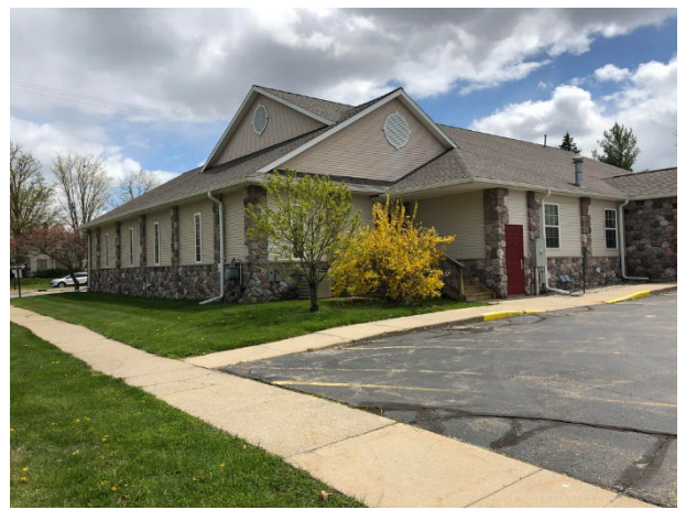
Join us at the Eaton Area Senior Center for our weekly Rotary meetings