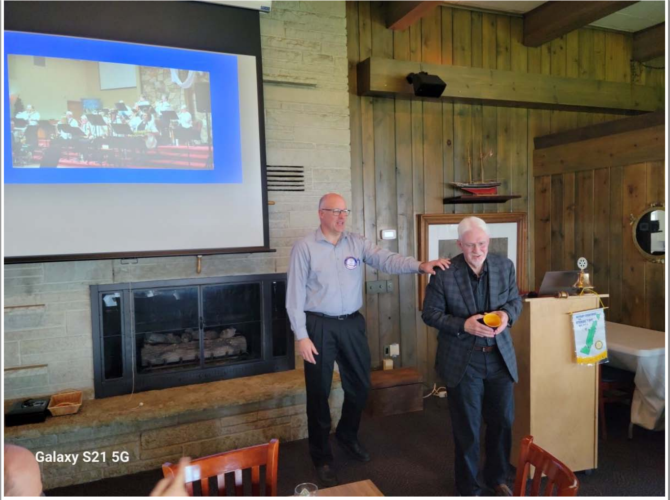
Galaxy S21 5G