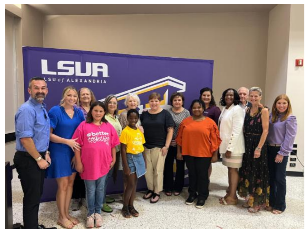
On June 18, we presented checks to local non-profit organizations who received grants from our Club. Grants were awarded to the following organizations:

Alexandria Museum Of Art Food Bank Of Cenla Rapides Symphony Orchestra YWCA Central Louisiana Arts and Healthcare, Inc. Community HealthWorx Fostering Community Inner-city Revitalization Glass Act River Oaks Art Square