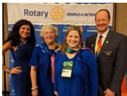
DGEs from 4 Rotary Districts (5750, 6110, 6150)