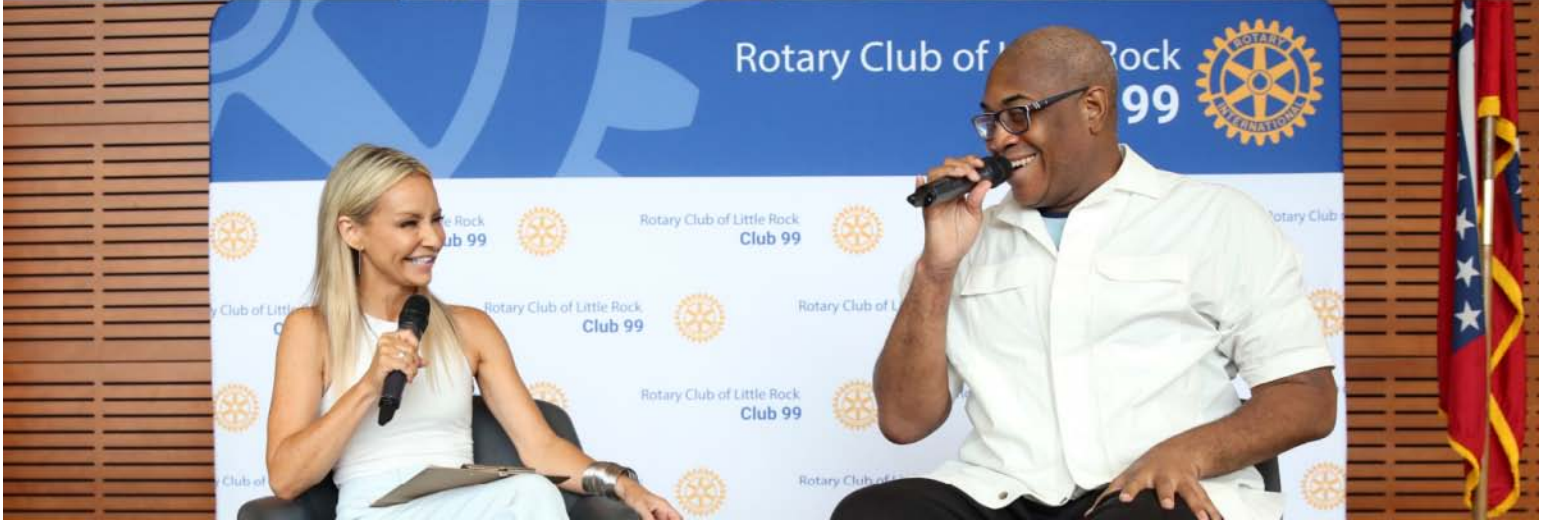
Members Caught Having Fun This Week