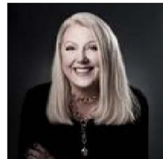
Wanda Hoover Bowen Law School