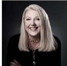
Wanda Hoover Bowen Law School