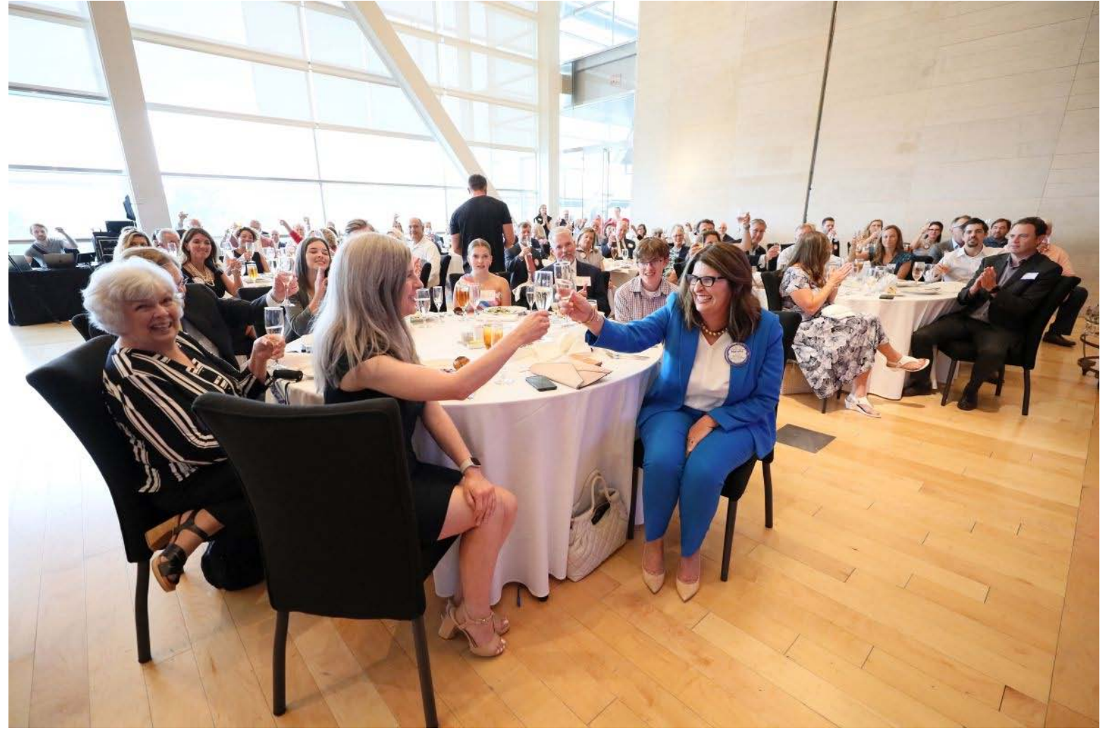
Cheers to the New Rotary Year!

Arkansas Circus Arts performers added to the fun!