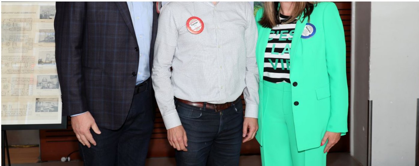
Members Caught Having Fun This Week