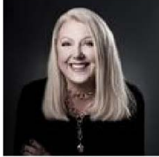
Wanda Hoover Bowen Law School