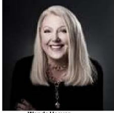
Wanda Hoover Bowen Law School