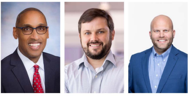
Hatcher Capitol Investments