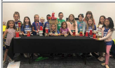
Kids at Conference - they made robots!