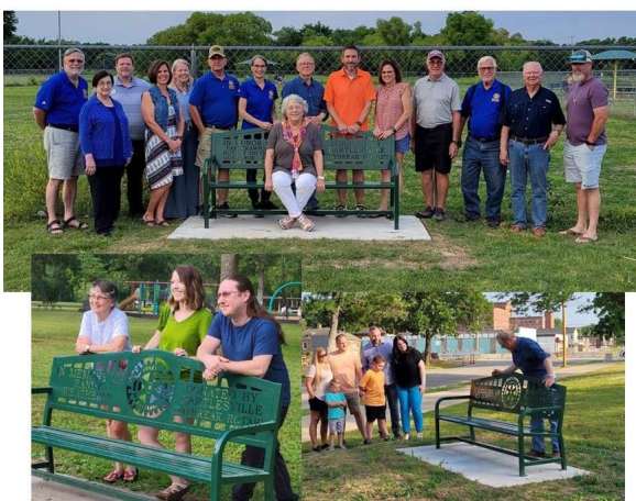
There are a lot more places to rest