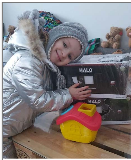
Critical solar lights from MSNI