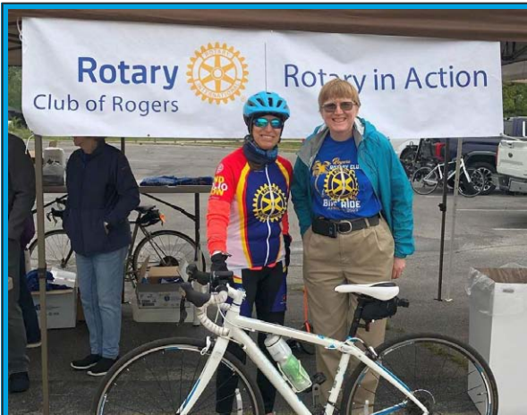
The Rogers Rotary Club held its first Bike Ride recently. Some 53 riders rode 15 or 40 miles to raise funds for a project in the Marshall Islands.