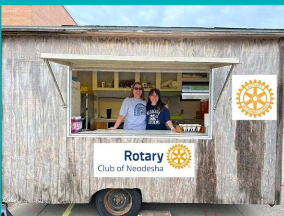
The Neodesha Rotary Club served snow cones at Heller Elementary at the end of school. What a cool project!