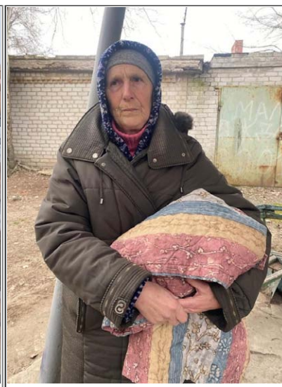
Homeless woman from Bakhmut Ukraine with a blanket from Tulsa Cancer Treatment Center

WHAT'S THIS ALL ABOUT? Medical Supply Network Inc (MSNI) is a District program that provides medical and other equipment around the world. Look in the "Box score" story to see how many shipments to Ukraine they have sent so far.