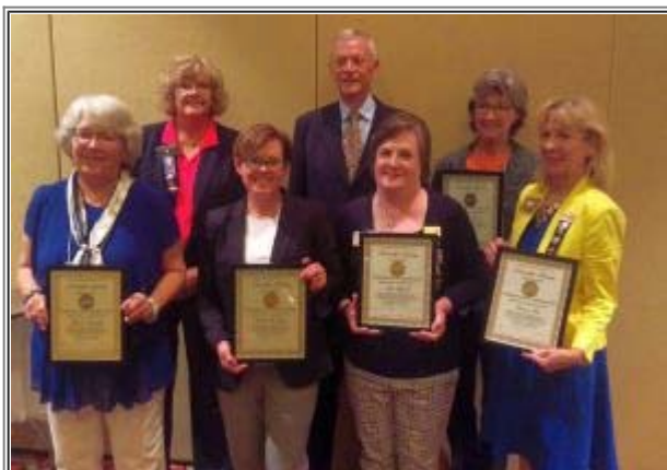
DLA Graduating class a few years back - men ARE allowed to take the course!