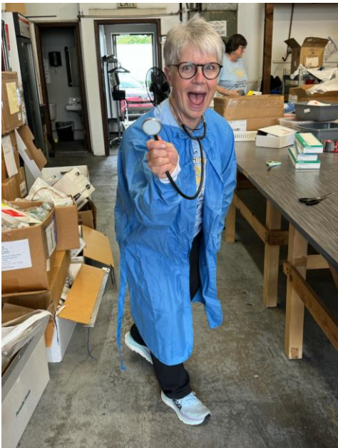
Doctor O will see you now!