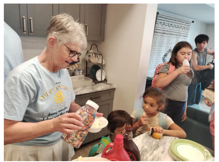
More sprinkles please.