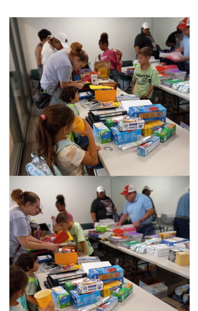
Lots of school supplies, courtesy of...us!!