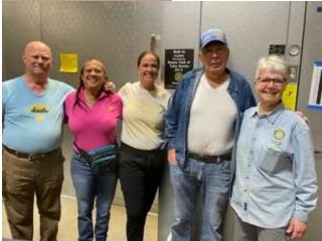
The Jenks Food Bank was the recipient of volunteer support from this awesome group of Sunrisers. Mark your calendar from June 17 th to be part of the next volunteer opportunity.